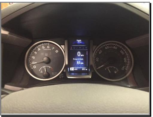
No MIL Illuminated

Considering the fact that a capable scan tool is the only way to identify some DTCs, Toyota requires that repairers perform a "Health Check" diagnostic scan if a vehicle has sustained damage as a result of a collision that may affect electrical systems. Additionally, Toyota strongly recommends that repairers perform a "Health Check" diagnostic scan before and after every repair to identify and document DTCs. If DTCs are identified pre-repair, then they can be considered to create a complete vehicle damage analysis report. If DTCs are identified post-repair, then they can be diagnosed and addressed before returning a vehicle to the customer.